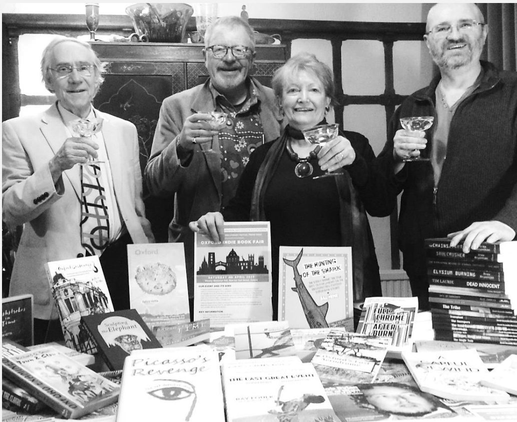
The organisers (from left)