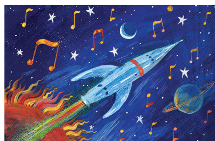
Paintings raffled for charity