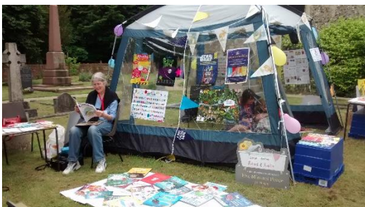
The Storytelling Tent

Sunday stories, book swaps and The Big Draw now feature and with our lively, friendly regular meetings members inspire each other with their love of all things bookish! The team is looking forward to hosting the special 50th anniversary Conference at Queenswood in April 2018.